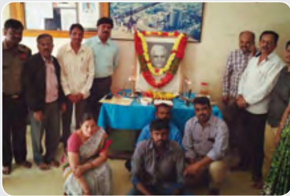
In the picture : Bangalore Employees

Employees of Prasad Group across all our facilities celebrated our founder Shri.L.V.Prasad's Birthday on 17th January 2017.