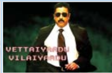
Digital Intermediate and Visual Effects by EFX, Chennai