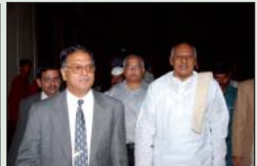
Mr.Rosayya, Minister for Finance & Legislative affairs, Govt. of Andhra Pradesh arriving to preside over the function