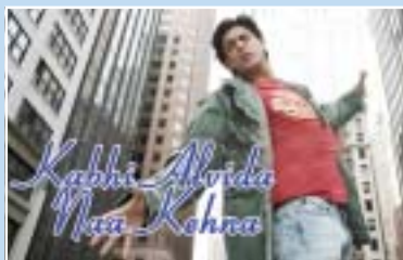
DVD Authoring by Prasad Video Digital, Chennai