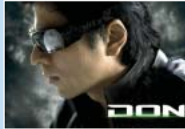
Lab Services by Prasad Film Labs, Mumbai