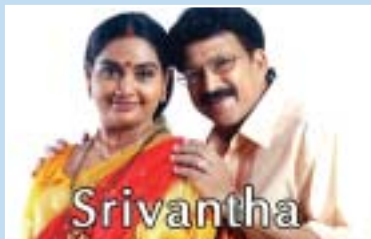
Lab Services by Prasad Film Laboratories, Bangalore