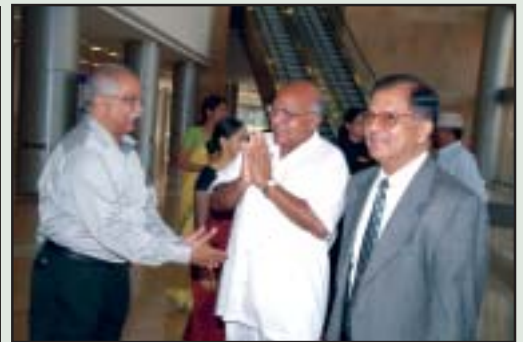
Dr.Ramoji Rao, Special Invitee arriving to grace the function