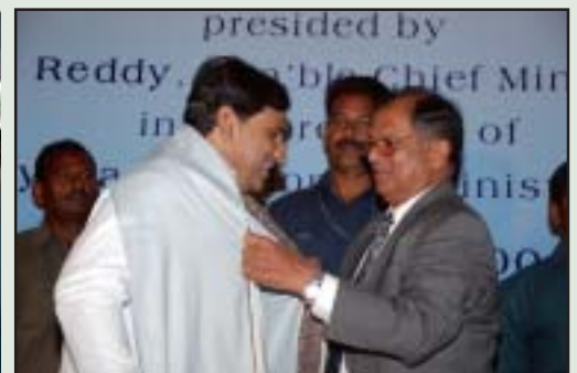
Chief Guest Dr.Shakeel Ahmad, Hon'ble Union Minister of State for Communications and IT honoured by Ramesh Prasad