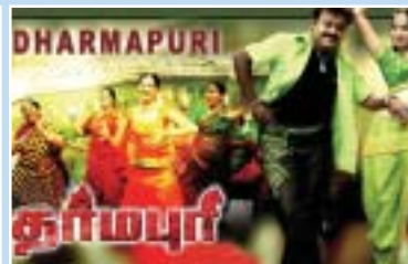
Lab Services by Prasad Film Laboratories, Chennai