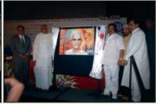
Commemorative Postage Stamp of Shri L.V.Prasad being released by Chief Guest Dr.Shakeel Ahmad, Hon'ble Union Minister of State for Communications and IT