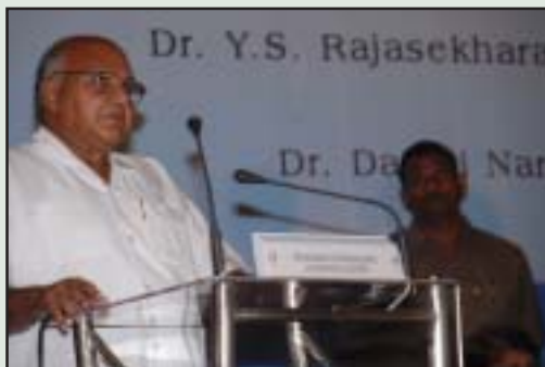
Dr.Ramoji Rao addresses the gathering