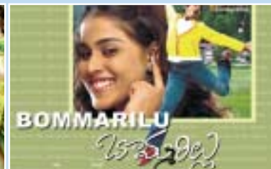
Lab Services by Prasad Film Laboratories, Hyderabad