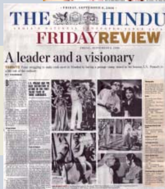
The Hindu, September 08, 2006