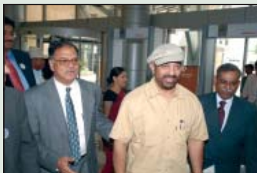
Dr.Kamal Haasan, Special Invitee arrives at the venue