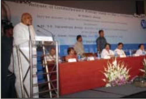
Presidential address by Mr.Rosayya, Minister of Finance & Legislative affairs, Govt. of Andhra Pradesh