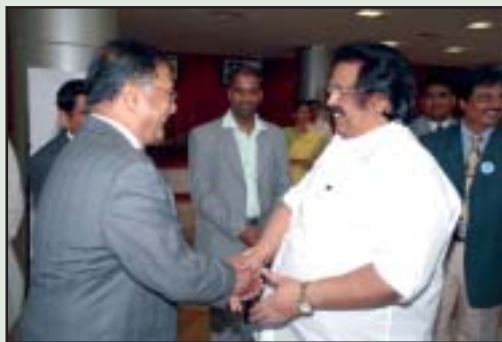
Ramesh Prasad welcomes Dr. Dasari Naryana Rao, Hon'ble Union Minister of State for Coal