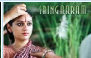
Audio Services by Prasad Group