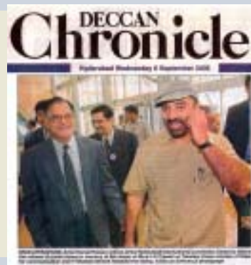
Deccan Chronicle, September 06, 2006

Actor Kamal Hassan arrives at the Hyderabad International Convention Centre to attend the release of postal stamp in memory of the doynwn of films L.V.Prasad on Tuesday. Union minister of State for communication and IT Shakeel Ahmed released the stamp