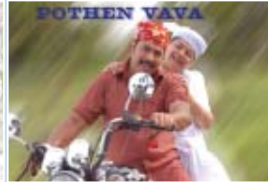
Lab Services by Prasad Film Laboratories, Thiruvananthapuram