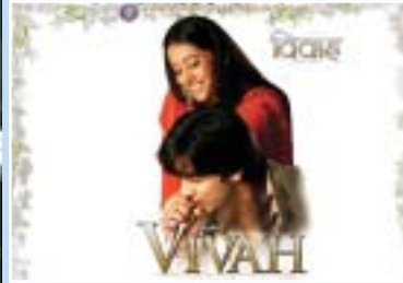
Visual Effects & Digital Intermediate by Prasad EFX, Mumbai