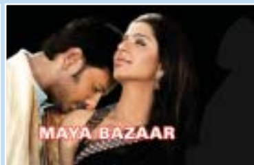
Visual Effects by EFX, Chennai