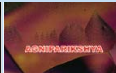
Lab Services by Prasad Film Laboratories, Bhubaneswar