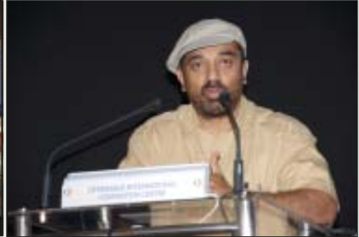
Dr.Kamal Haasan addressing the gathering