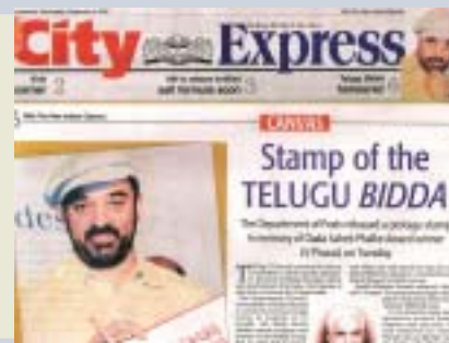
The New Indian Express, September 06, 2006