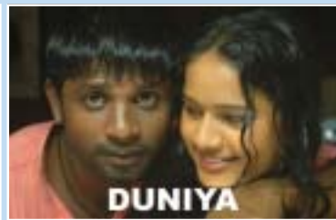
Lab Services by Prasad Film Laboratories, Bangalore