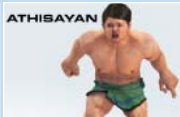
Visual Effects by EFX, Chennai