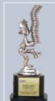
FICCI - BAF AWARD Best VFX (Outstanding Indian Content)