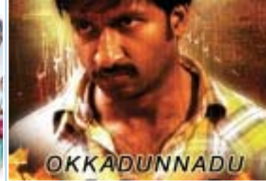
Lab Services by Prasad Film Laboratories, Hyderabad