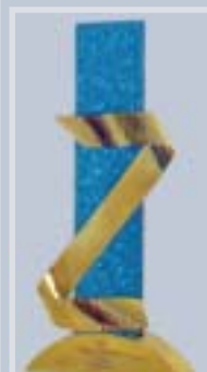
ZEE TECHNICAL AWARD - Best VFX