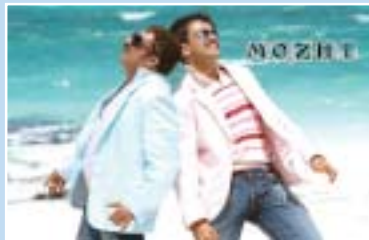
Audio & Lab Services by Prasad Group, Chennai