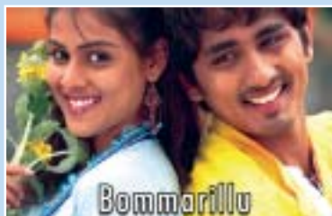
DVD Authoring by Prasad Video Digital, Chennai