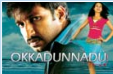
Visual Effects by EFX, Hyderabad