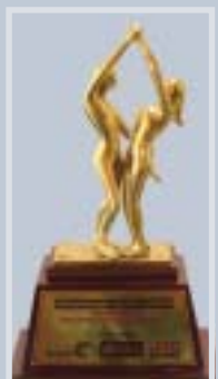
BROADCAST INDIA AWARD - Best VFX