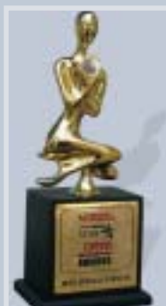
SCREEN AWARD Best VFX