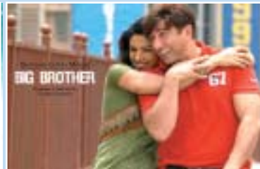
Digital Intermediate & Visual Effects by Prasad EFX, Mumbai