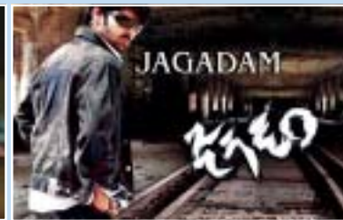
Digital Intermediate by EFX, Chennai