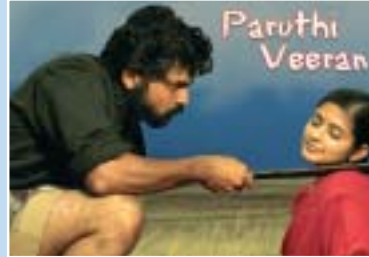
Lab Services by Prasad Film Labs, Chennai