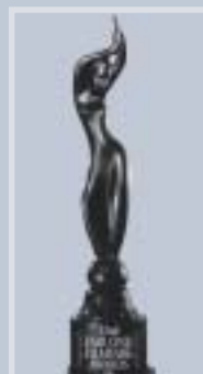
FILMFARE AWARD Best VFX