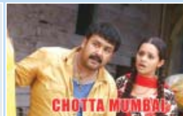
Lab Services by Prasad Film Laboratories, Thiruvananthapuram