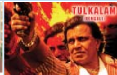
Lab Services by Prasad Film Laboratories, Bhubaneswar