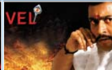
DI & Visual Effects by EFX, Chennai