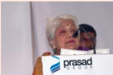
Actress 'Sowcar' Janaki recollects fond memories of Shri.L.V.Prasad