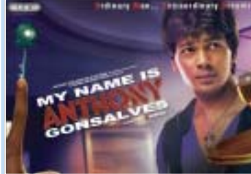
Lab Services by Prasad Film Labs, Mumbai.