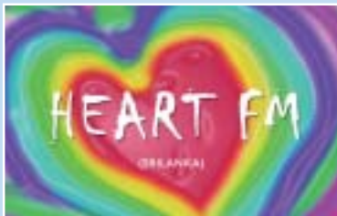
Audio Services by Prasad Recording Studios, Chennai