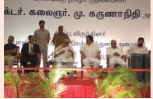
Hon'ble Chief Minister of Tamilnadu, K. Karunanidhi addressing the gathering