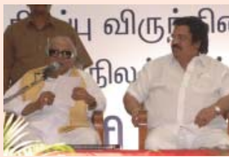
Hon'ble Chief Minister of Tamilnadu, Kalaingar. M. Karunanidhi & Hon'ble Minister, Dr. Dasari Narayana Rao on stage