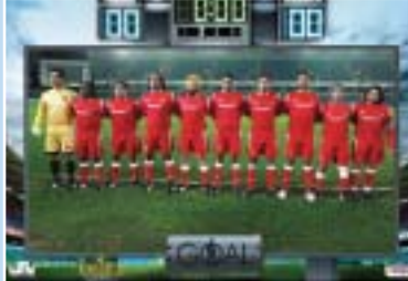
DI & VFX by Prasad EFX, Mumbai