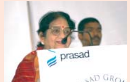
Actress Anjali Devi felicitating Shri.L.V.Prasad