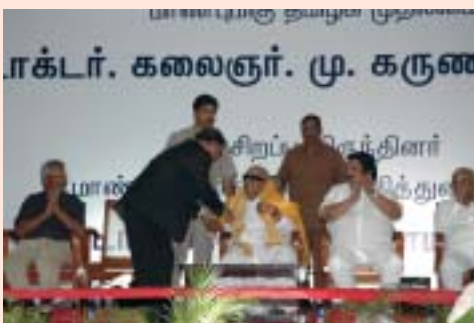
Ramesh Prasad honouring Hon'ble Chief Minister of Tamilnadu, Kalaingar. M. Karunanidhi