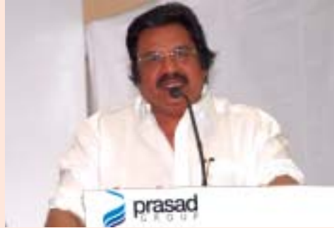
Hon'ble Union Minister of State for Coal, Dr. Dasari Narayana Rao addressing the gathering