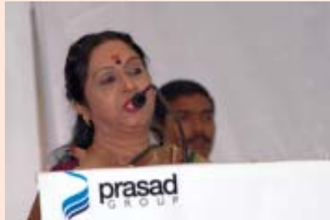
Actress Saroja Devi felicitating Shri.L.V.Prasad