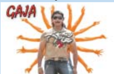
Lab Services by Prasad Film Laboratories, Bangalore