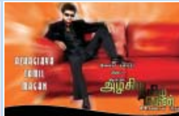
DI & VFX Services by EFX-Chennai