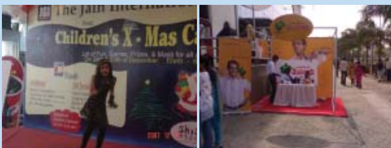
X-Mas children carnival was celebrated at Prasads on 24th December 2007.

Prasads launched PRASADS 4D FX theatre on 17th January 2008 and it was a visual treat to the audience. It gives a multi-sensory experience to the people. Special computerized show control systems allow seamless integration of stunning 3D video and environmental effects. By employing unique special effects that are synchronized with events on the screen, 4D FX lets audience experience the rumbling of an earthquake, wind gusts on a mountain peak etc. The audience will enjoy stereoscopic 3D, full three degree of motion, wind effects, air jets etc.