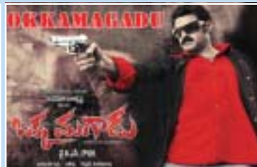
Visual Effects by EFX, Hyderabad & Chennai