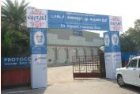
The entrance Arch at the venue

Recalling his association with L V Prasad, M.Karunanidhi said, "He took great pride in having been an associate of Mr Prasad. He was happy to note that his sons were ably continuing the legacy of Mr Prasad". Dr.Dasari Narayan Rao said, "Mr Prasad was an icon of Indian cinema and was known for making good films".