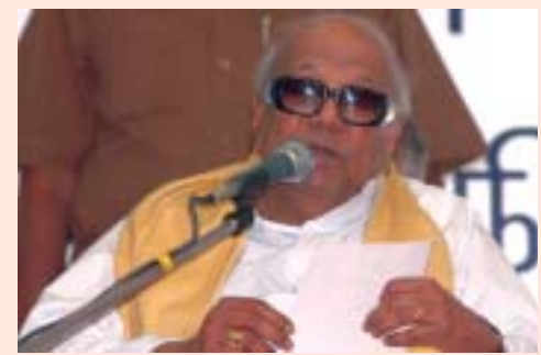
Hon'ble Chief Minister of Tamilnadu, Kalaingar. M. Karunanidhi addressing the gathering