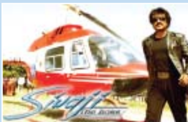
DVD Authoring by Prasad Video Digital, Chennai