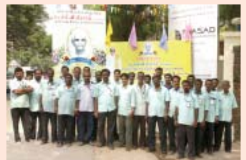
Prasad Film Labs - Chennai employees with the banners felicitating Shri.L.V.Prasad