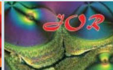
Lab Services by Prasad Film Laboratories, Bhubaneswar