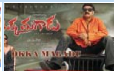
Lab Services by Prasad Film Laboratories, Hyderabad