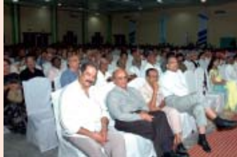
The elite gathering