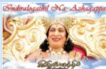
Lab Services by Prasad Film Laboratories, Chennai