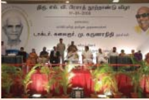
The delegates on stage