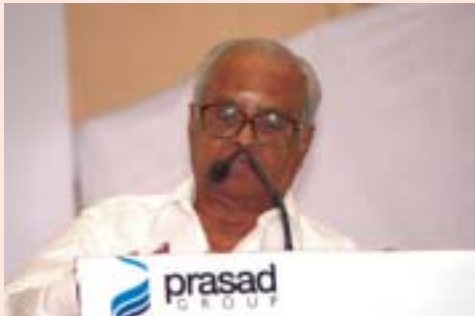
Director K. Balachander addressing the audience