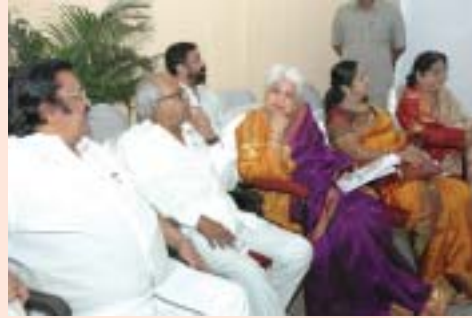
A section of Special Invitees