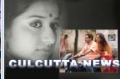
Lab Services by Prasad Film Laboratories, Thiruvananthapuram