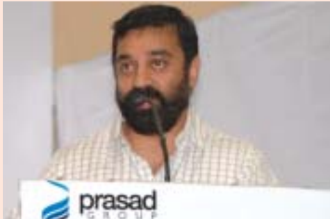
Padmashree, Dr. Kamal Hassan brought back his memories of Shri.L.V.Prasad