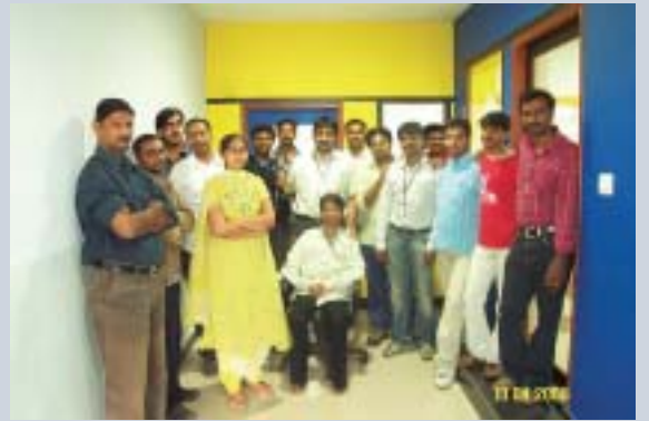
The EFX - Hyderabad team