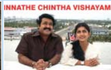
Lab Services by Prasad Film Laboratories, Thiruvananthapuram