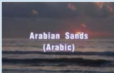
Lab Services by Prasad Film Labs, Mumbai.