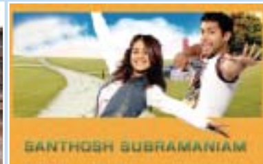
DI & Visual Effects by EFX, Chennai