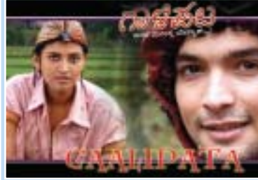
Lab Services by Prasad Film Laboratories, Bangalore & DI & VFX by EFX, Chennai