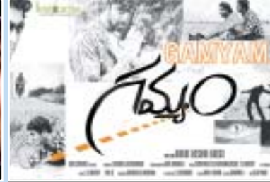
Lab Services by Prasad Film Laboratories, Hyderabad & VFX by EFX - Hyderabad