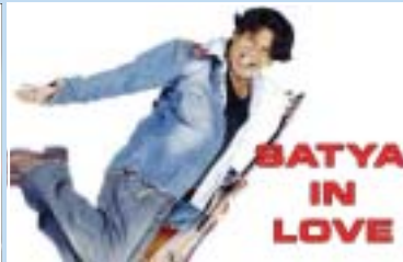
DI & VFX Services by EFX, Chennai