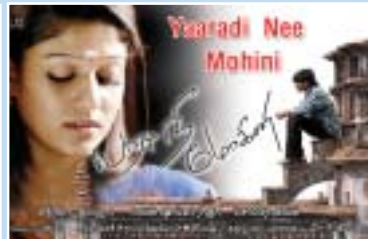
Visual Effects by EFX, Chennai