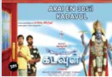
Lab Services by Prasad Film Labs, Chennai