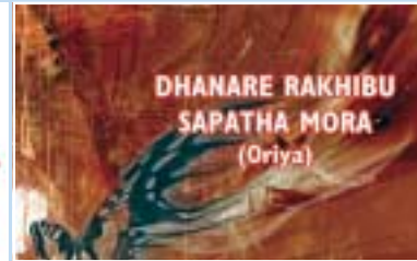
Lab Services by Prasad Film Laboratories, Bhubaneswar