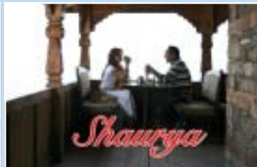
DI & Opticals by Prasad EFX, Mumbai