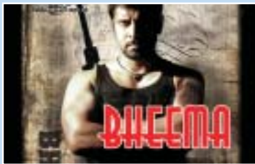
DVD Authoring by Prasad Video Digital, Chennai