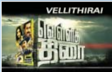
Audio Services by Prasad Recording Studios, Chennai