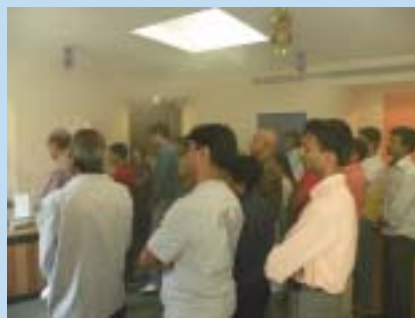
Employees of Prasad Film Labs, Mumbai at the Founder's Day puja