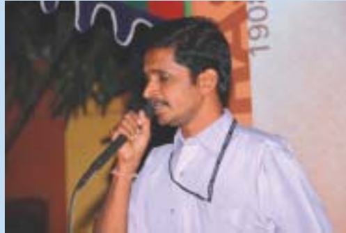
Prayer song by Kumaresan of Prasad Video Digital