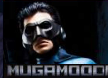
MUGAMOODI - Lab Services