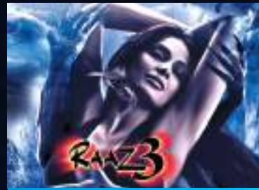
RAAZ 3 - 3D Movie Solutions, VFX, DI, Lab Services