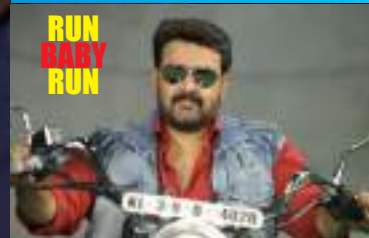
RUN BABY RUN - Lab Services, VFX