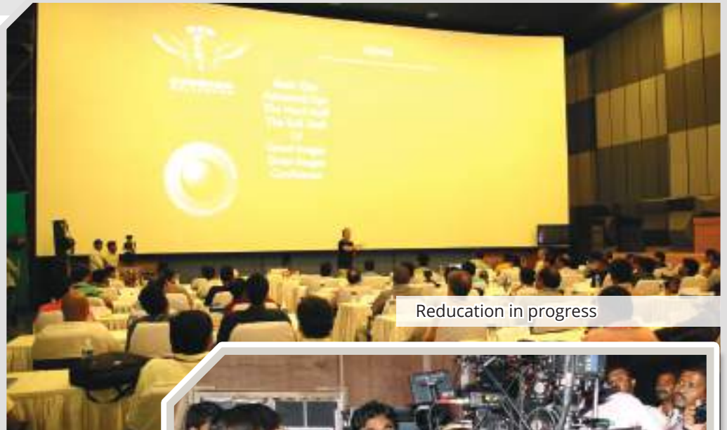
Reduction in progress