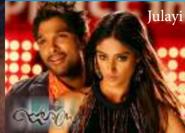
JULAYI - Lab Services