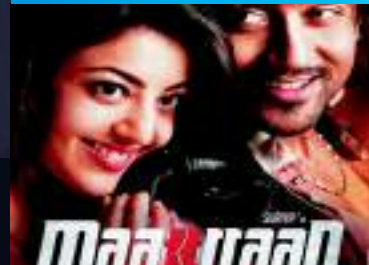
MAATTRRAAN - VFX