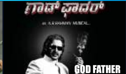
GOD FATHER - VFX, DI, Lab Services