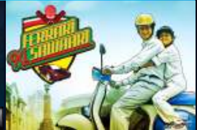
FERRARI KI SAWAARI - Bluray Compression & Authoring