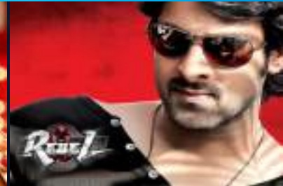
REBEL - VFX, DI