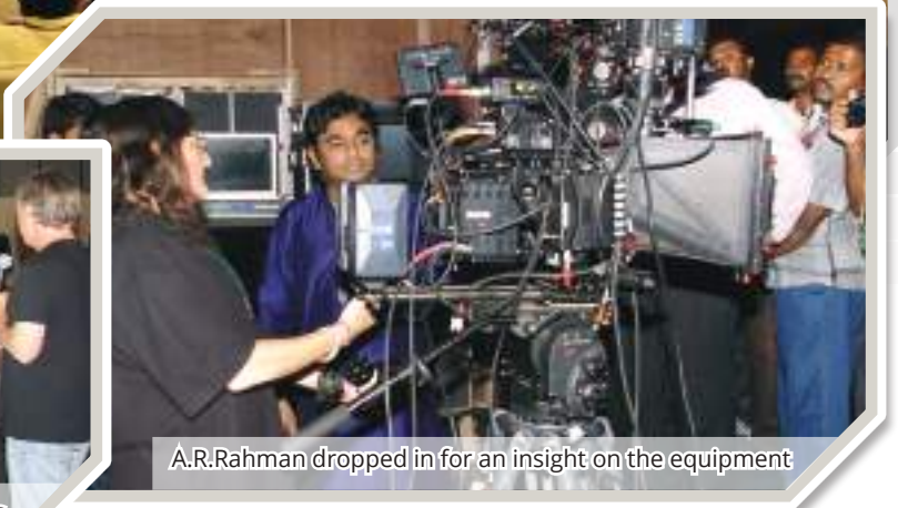
A.R.Rahman dropped in for an insight on the equipment